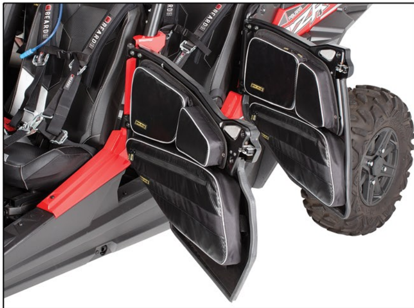
Shown with Front and Rear door Upper and Lower Bags